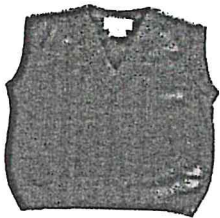
Vest (Boys & Girls)