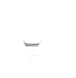
Short Sleeve Polo