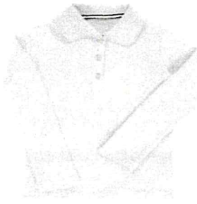
Long Sleeve Polo