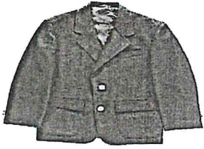
Blazers (Boys & Girls)